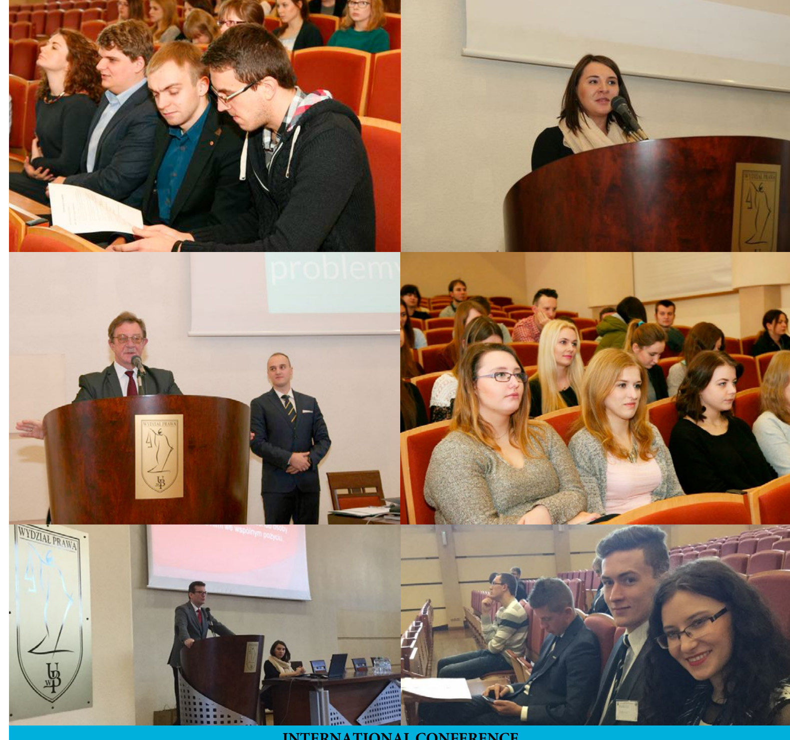
INTERNATIONAL CONFERENCE "INTERDISCIPLINARY PROBLEMS OF CORRUPTION" (16 December 2015, Bialystok, Poland)